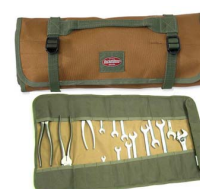
Tool Roll $13.76 - $12.25 Save: 11% off